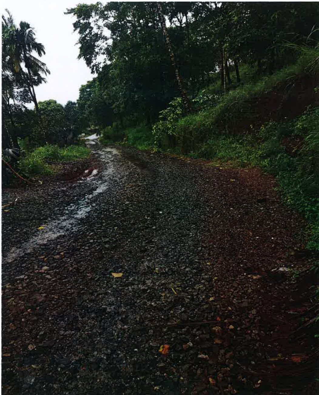
Plate G-3: Avenue trees already exit along tarred road.