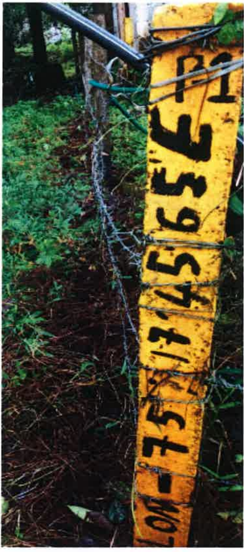
Plate G-9: Fenced around the Quarry Area