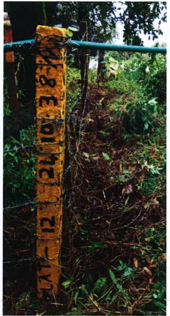
Plate S-1: Fenced with around the lease area.