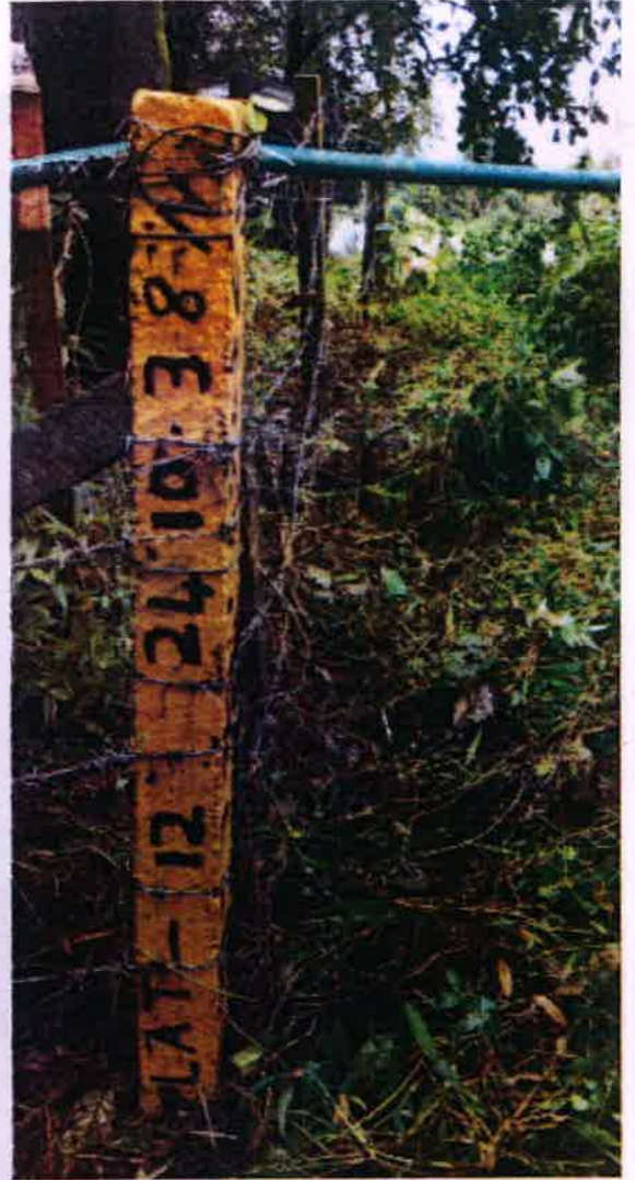
Plate S-1: Fenced with around the lease area.