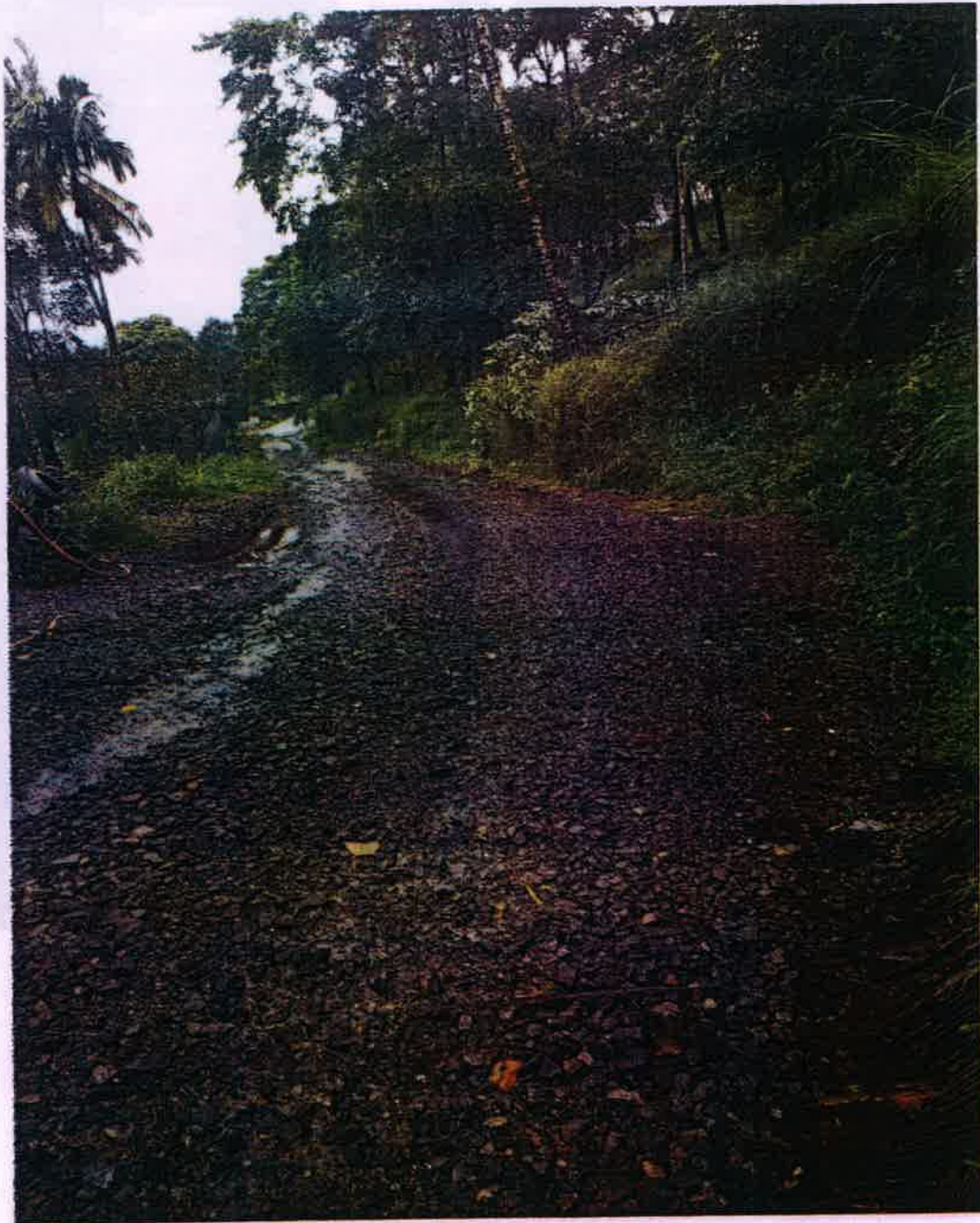
Plate G-3: Avenue trees already exit along tarred road.