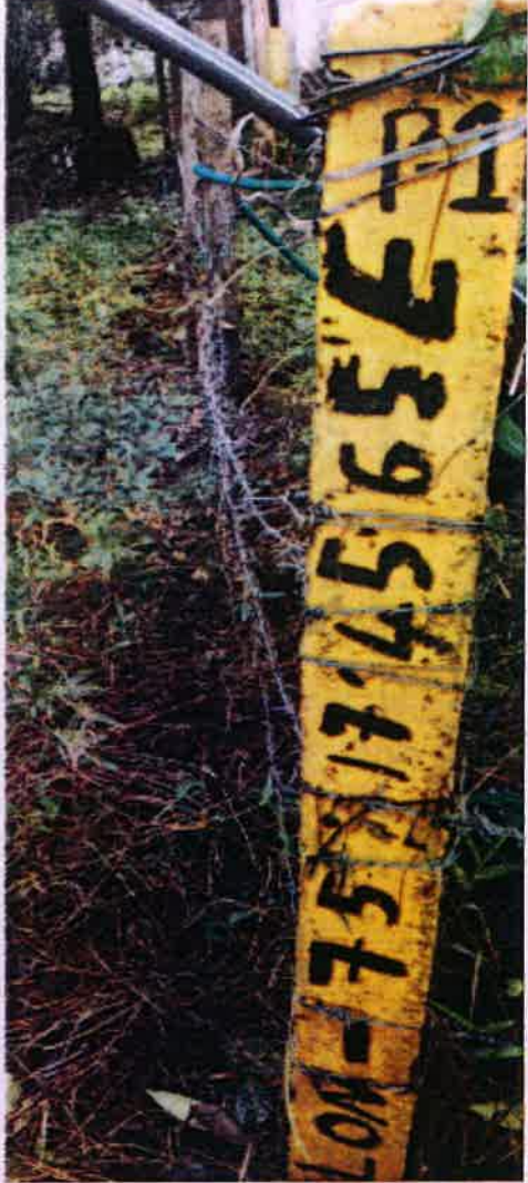
Plate G-9: Fenced around the Quarry Area